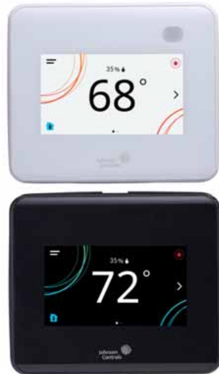
Figure 1: TEC3000 Color Series Thermostat Controller shown with and without occupancy sensor in white and black enclosures

A bright, high-definition capacitive touchscreen display provides responsive feedback and improved readability of text and icons. The home screen is configurable to Modern and Classic, and Light and Dark themes.